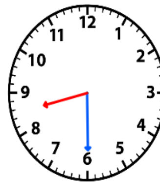
Half past 8

The hour hand points to the hour. At half past, the minute hand points to 6.